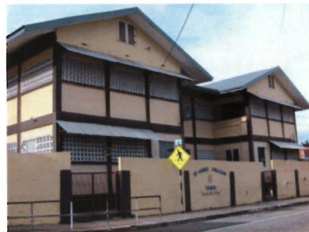
St. Agnes A.C. Primary School 18 Clarence Street St. James

There are two (2) schools under the management of the Priest-in-Charge of St. Agnes Anglican Church and they are St. Agnes Anglican Primary School and The Ascension Anglican Primary School.