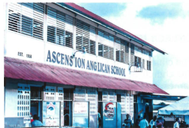
Ascension Anglican Primary School Cor. School & Dibe Roads Long Circular, St. James